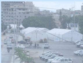
(WFP storage hall in Tyre)